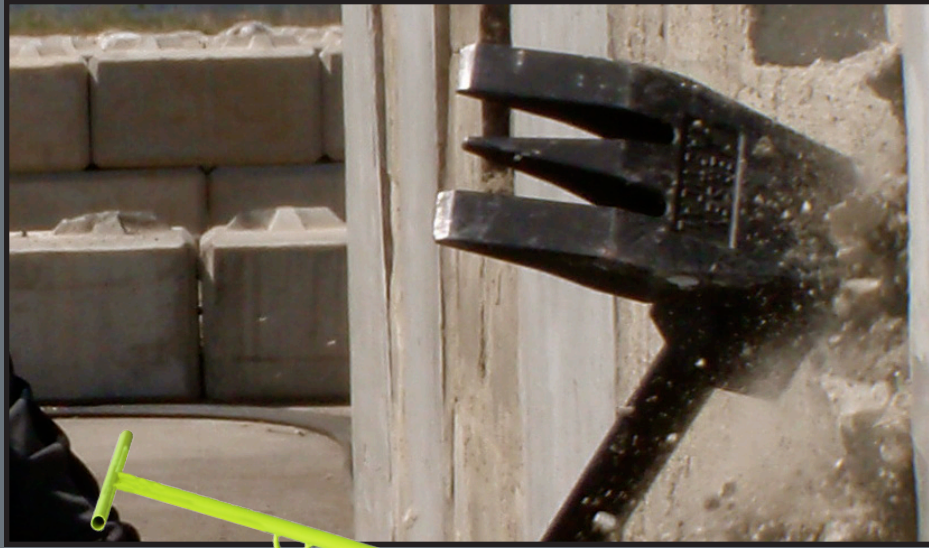
THE LEVER™ Model L-4002-MS