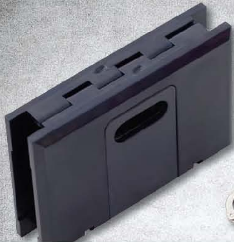
7082 Blue Box™ for chain cuffs