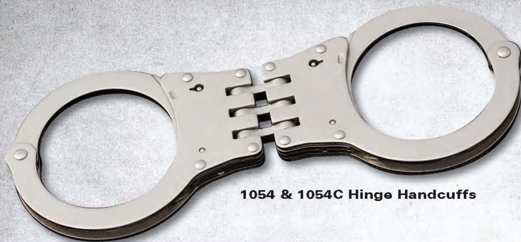
1054 & 1054C Hinge Handcuffs