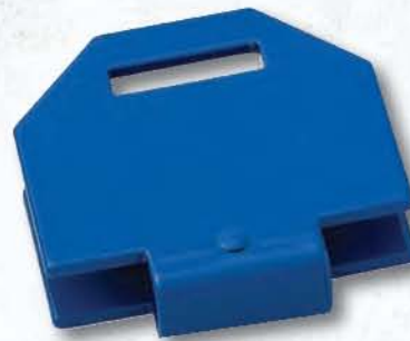
7083 Blue Box™ for hinge cuffs