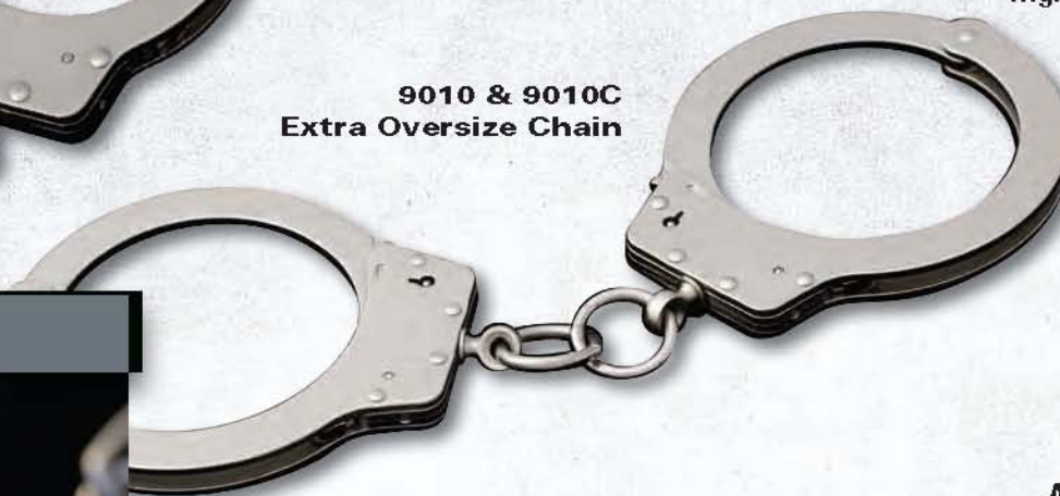
9010 & 9010C Extra Oversize Chain