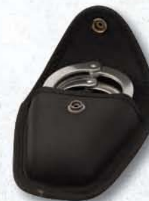
NCH-7 (& 1010)